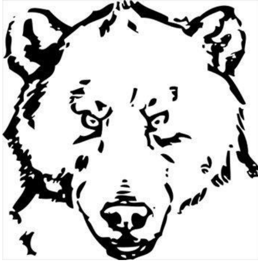
The TASIS Dorado Bear

“Love of Children” is our distinctive mark as educators at TASIS Dorado!